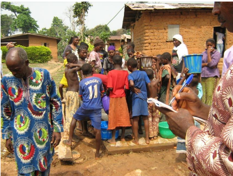
Figure 1. Women and children at the site

Commission in Abuja. Since we were not involved in the fiduciary aspect of the work, we are unable to give any account of this. We have extracted part of our proposal (given below) to complement our report. To ensure sustainability, a Project Monitoring Committee of 8 had earlier been elected by the community to oversee the running of the borehole.