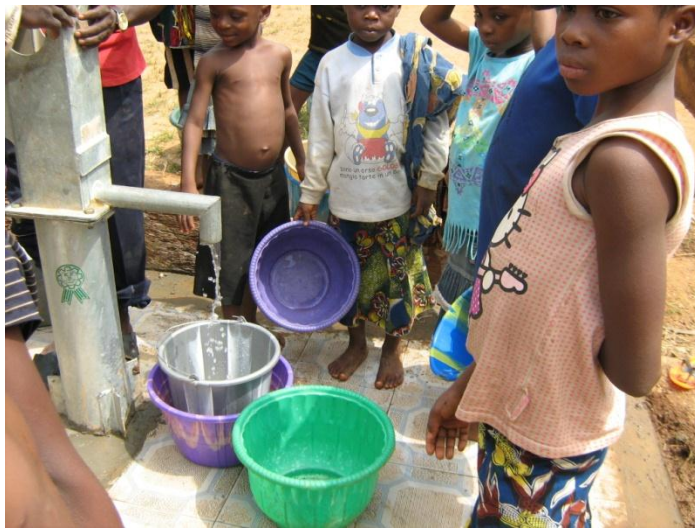
Figure 3. Pronto! Water flows