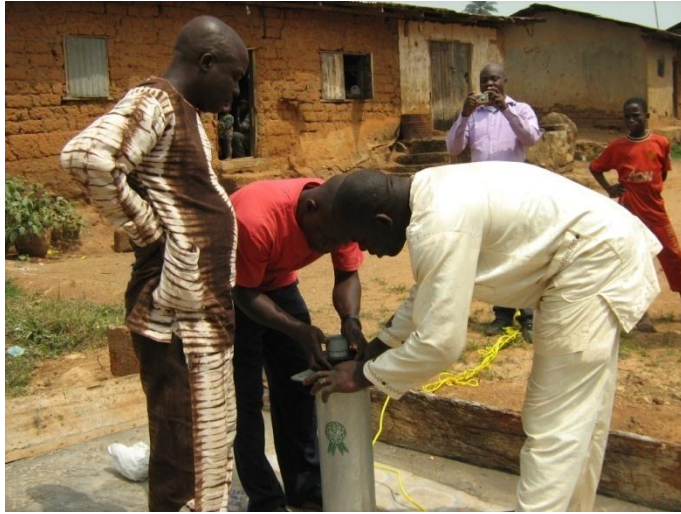
Figure 2. Fixing the borehole