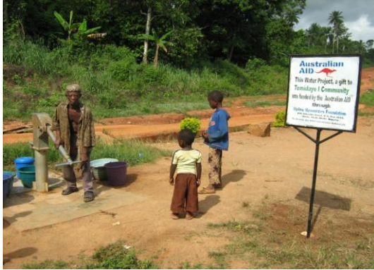
Figure 4. A man fetching water with kids onlooking